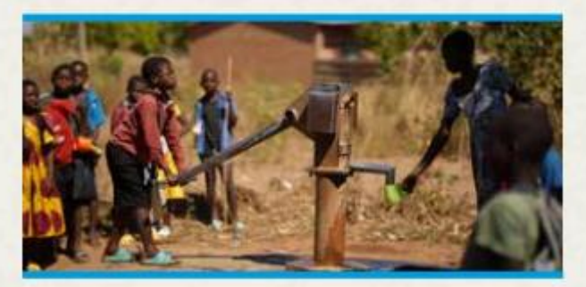
Patrick uses the water pump at Puteya Primary School.