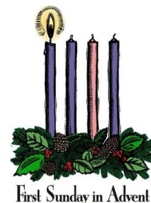
First Sunday in Advent